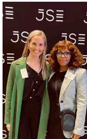
Alexandra Education Committee Cocktail Function